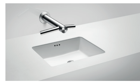
Under counter External dimensions L x W 550mm x 405mm (19-7/8" x 15-15/16")