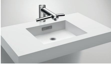
Wall mounted External dimensions L x W 914mm x 559mm (36" x 22")