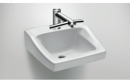
Wall mounted External dimensions L x W 20" x 18-1/4"

Compatibility AB09 AB11 AB11 requires blanking plate