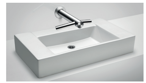
Counter top External dimensions L x W 802mm x 473mm (31-9/16" x 18-5/8")

Compatibility AB09 AB11 AB11 requires blanking plate