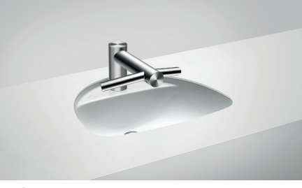
Under counter External dimensions L x W 510mm x 420mm