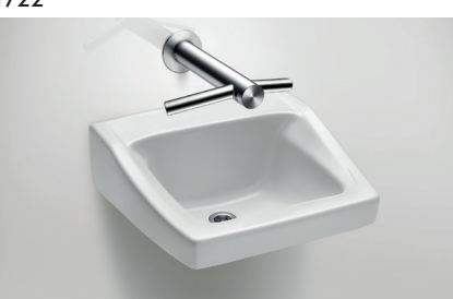
Wall mounted External dimensions L x W 489mm x 438mm (19-1/4" x 17-1/4")

Compatibility AB09 AB11 AB11 requires blanking plate