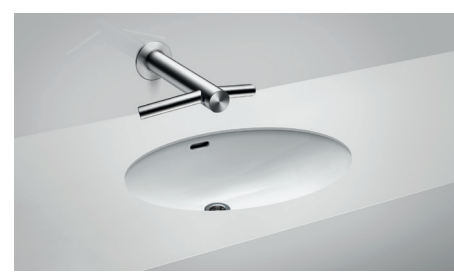
Under counter External dimensions L x W x D 530mm x 370mm x 205mm