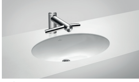
Under counter External dimensions L x W 615mm x 415mm