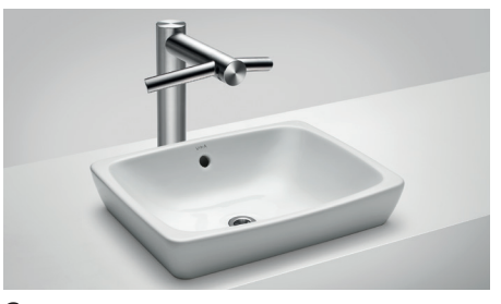
Counter top External dimensions L x W 500mm x 400mm