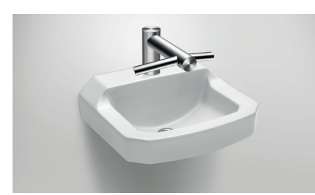
Wall mounted External dimensions L x W 500mm x 442mm (19-5/8" x 17-3/8")