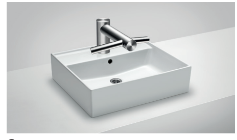
Counter top External dimensions L x W 500mm x 450mm

Compatibility AB09 AB11 AB11 requires blanking plate