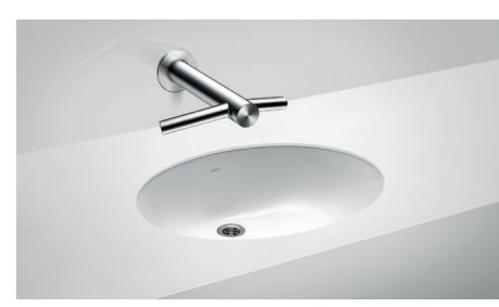
Under counter External dimensions L x W 580mm x 450mm