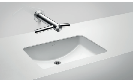
Under counter External dimensions L x W 591mm x 413mm (23-1/4" x 16-1/4")