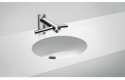
Under counter External dimensions L x W 432mm x 427mm (19-1/2" x 16-3/4")