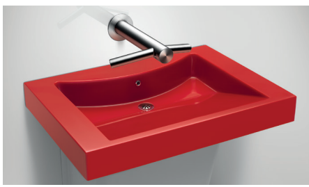
Wall mounted External dimensions L x W 30" x 21.5"