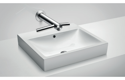
Counter top External dimensions L x W 550mm x 500mm