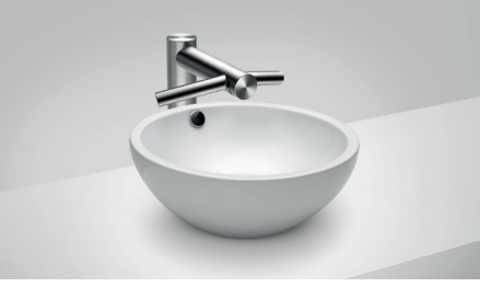
Counter top External dimensions L x W 445mm x 445mm