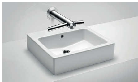
Counter top External dimensions L x W 500mm x 470mm

Compatibility AB09 AB11 AB11 requires blanking plate