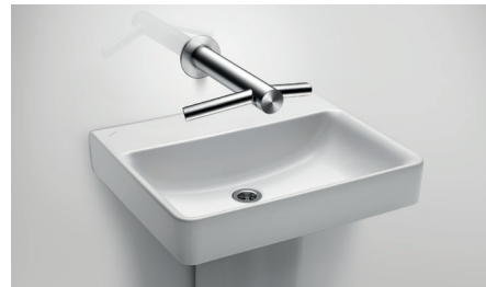
Pedestal mounted External dimensions L x W 550mm x 465mm

Compatibility AB09 AB11 AB11 requires blanking plate