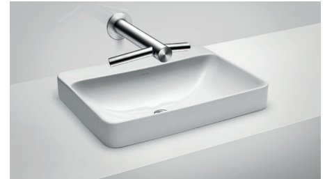
Counter top External dimensions L x W 584mm x 460mm (23" x 18-1/8")

Compatibility AB09 AB11 AB11 requires blanking plate